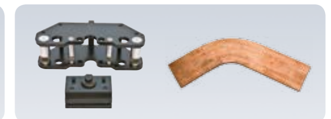
Vertical Bending Molds