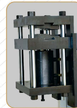
Bending press unit